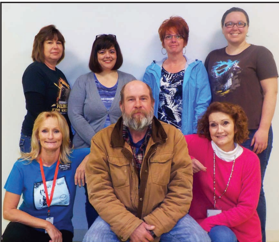
Members of AFSCME Local 3405 work in the Granite City Library.