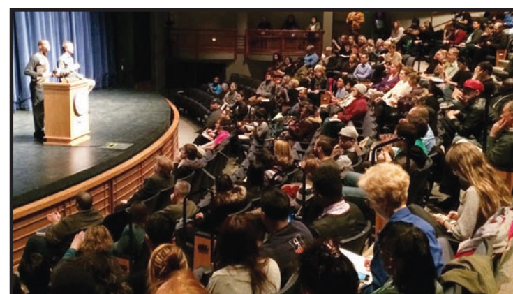
Students, faculty, staff and community members rally together at Northeastern Illinois University.

Protests have sprung up at campuses across the state, drawing attention to the dire plight of the public university system.