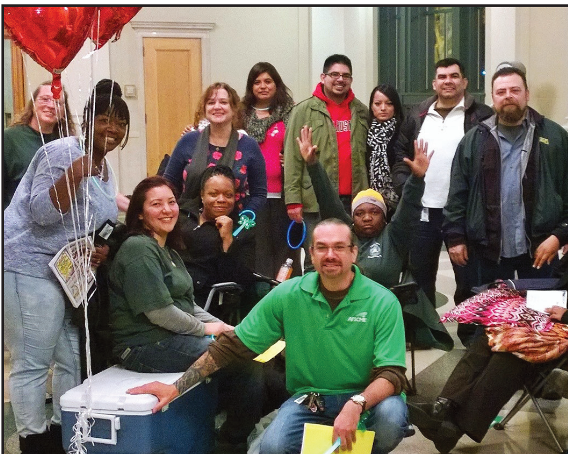
Members of Rockford's AFSCME Local 1058 occupy City Hall during their contract campaign.

Bargaining sessions are set for late March.