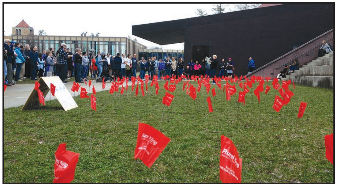
Universities facing a state funding crisis have been forced to lay off employees. The red flags represent 261 laid-off workers at Eastern Illinois University.

AFSCME members are standing with faculty members and others in their university communities to demand that Gov. Rauner stop harming higher education.