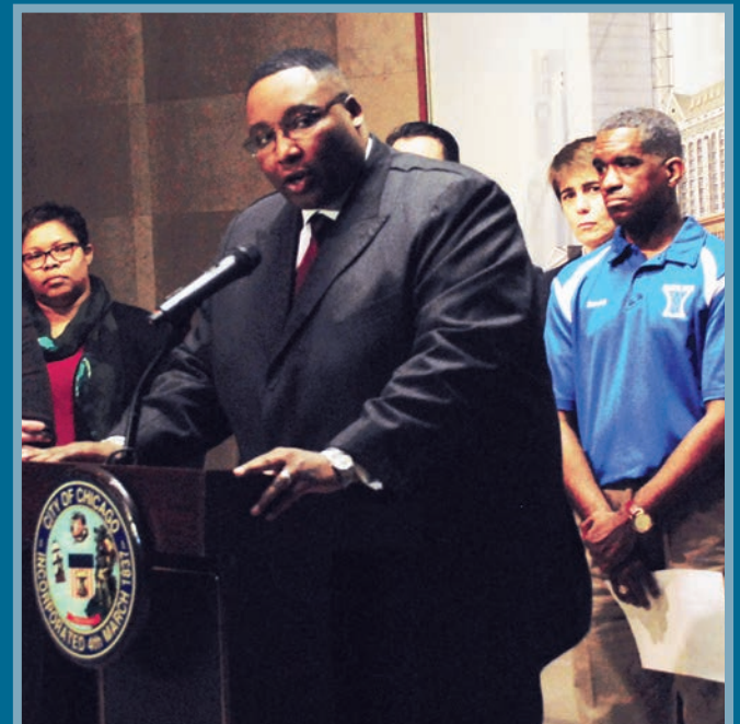
Chicago Alderman Jason Ervin supports accessible mental health services.

AFTER CLOSING HALF OF THE city's mental health clinics in 2012, the Chicago Department of Public Health continues to operate six clinics that provide a vital safety net for those who have few alternatives by