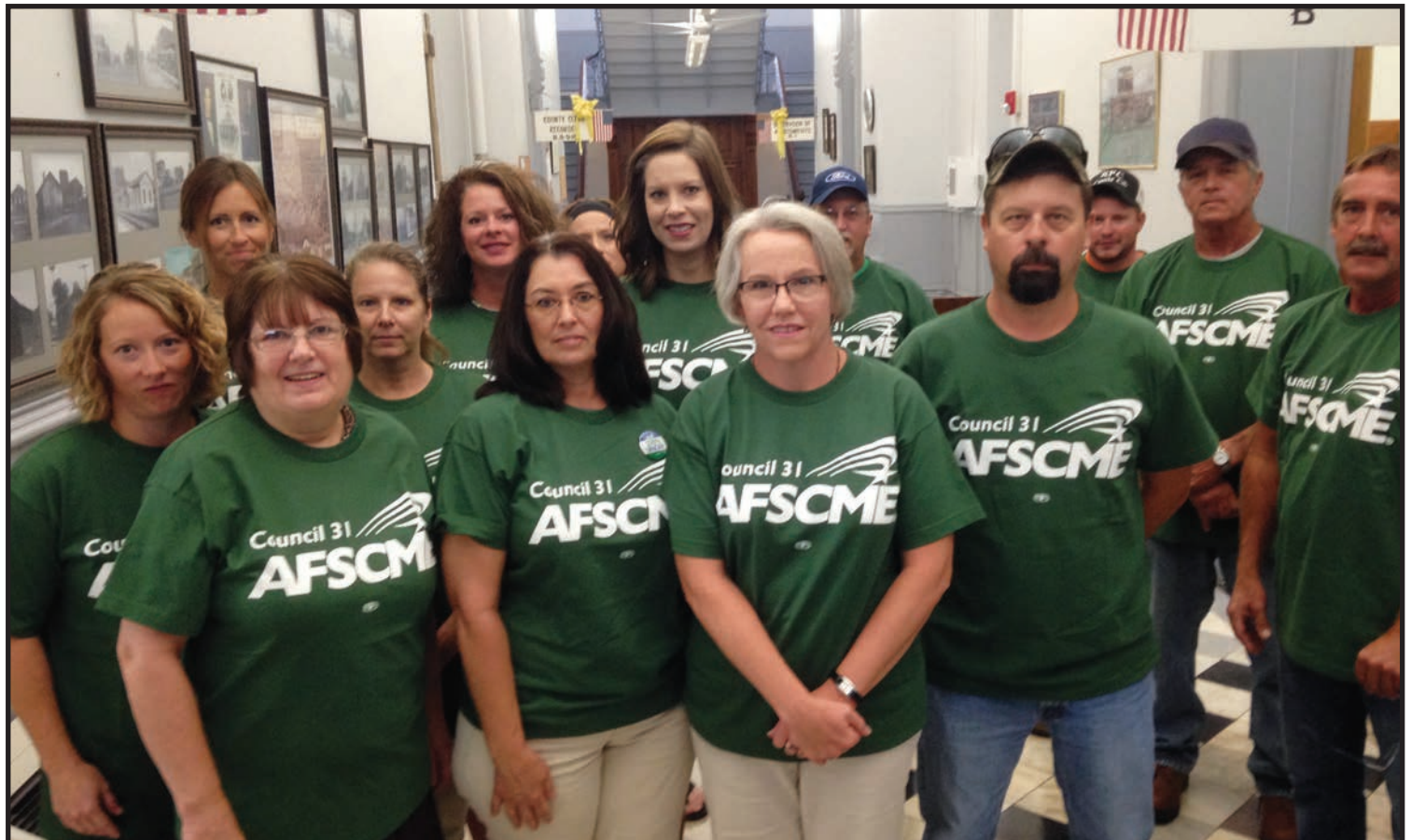
Members of AFSCME Local 3323 protest at the Shelby County Board meeting, making a stand for a fair contract.

In addition to maintaining health care coverage, members also won increases in both the uniform and tool allowances and increased "pager pay" by 33