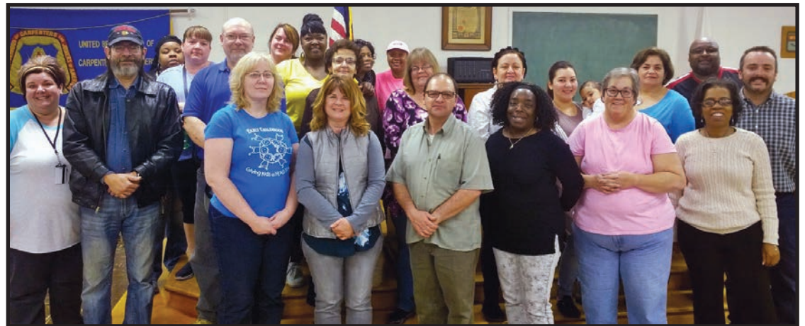
Local 1058 stands in solidarity as some units still negotiate.

WHILE THE MAJORITY OF THE local has been able to reach an agreement that members believe is fair, two units are not yet guaranteed much-needed wage increases for their families—employees at Rockford Head Start and the Rockford